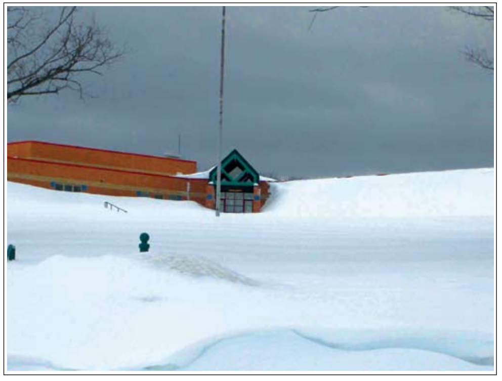
South Range Elementary School, near Houghton, is shown in this March 2006 photo after the Keweenaw Peninsula was hit with a storm that left nearly 50 inches of snow on the ground. Normal snowfall in the area for March is about 20 inches.