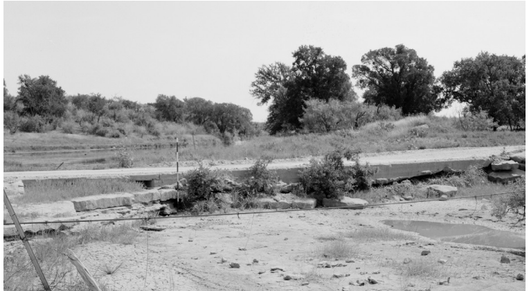
THIS 1989 PHOTO is of a bridge built from 1936-41 as part of a Works Progress Administration (WPA) project in Coleman County, Texas. Many Americans saw such projects as helpful, without considering their high cost and the corruption that plagued the program.

In his first 100 days, he swung hard at the profit order. Instead of clearing away the prosperity barriers erected by his predecessor, he built new ones of his own. He struck in every known way at the integrity of the U.S. dollar through quantitative increases and qualitative deterioration. He seized the people’s gold holdings and subsequently devalued the dollar by 40 percent. 18