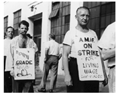
SPECIAL POWERS GRANTED to organized labor with the passage of the Wagner Act contributed to a wave of militant strikes and a “depression within a depression” in 1937.

A brief analogy will illustrate this point. If a thief goes house to house robbing everybody in the neighborhood, then heads off to a nearby shopping mall to spend his