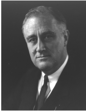
AMERICANS VOTED FOR Franklin Roosevelt in 1932 expecting him to adhere to the Democratic Party platform, which called for less government spending and regulation.

The act raised the rates on the entire range of dutiable commodities; for example, the average rate increased from 20 percent to 34 percent on agricultural products; from 36 percent to 47 percent on wines, spirits, and beverages; from 50 to 60 percent on wool and woolen manufactures. In all, 887 tariffs were sharply increased and the act broadened the list of dutiable commodities to 3,218 items. A crucial part of the Smoot-Hawley Tariff was that many tariffs were for a specific amount of money rather than a percentage of the price. As prices fell by half or more during the Great Depression, the effective rate of these specific tariffs doubled, increasing the protection afforded under the act. 10