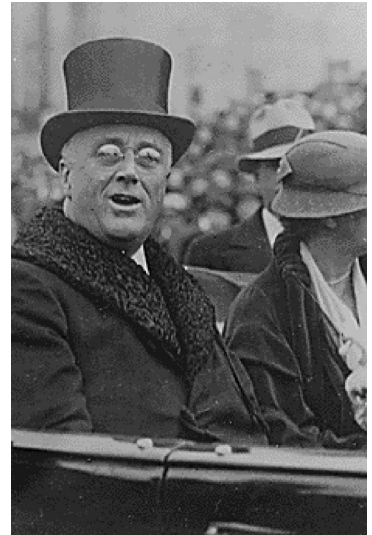
PRESIDENT FRANKLIN ROOSEVELT decried as selfish "economic royalists" those businessmen who opposed the burdensome taxes and regulations of his "New Deal."

Hoover dramatically increased government spending for subsidy and relief schemes. In the space of one year alone, from 1930 to 1931, the federal government's share of GNP soared from 16.4 percent to 21.5 percent. 13 Hoover's agricultural bureaucracy doled out hundreds of millions of dollars