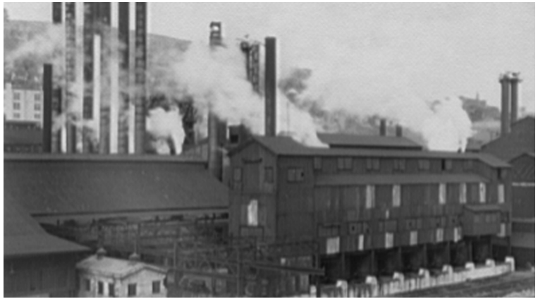
AT THE NADIR of the Great Depression, half of American industrial production was idle as the economy reeled under the weight of endless and destructive policies from both Republicans and Democrats in Washington.

Roosevelt secured passage of the Agricultural Adjustment Act, which levied a new tax on agricultural processors and used the revenue to supervise the wholesale destruction of valuable crops and cattle. Federal agents oversaw the ugly spectacle of perfectly good fields of cotton, wheat and corn being plowed under (the mules had to be convinced to trample the crops; they had been trained, of course, to walk between the rows). Healthy cattle, sheep and pigs were slaughtered and buried in mass graves. Secretary of Agriculture Henry Wallace personally gave the order to slaughter 6 million baby pigs before they grew to full size. The administration also paid farmers