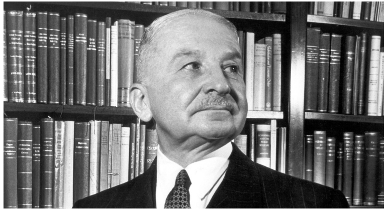
LUDWIG VON MISES understood the nature of inflation — and its source.

“Government,” observed the renowned Austrian economist Ludwig von Mises, “is the only institution that can take a valuable commodity like paper, and make it worthless by applying