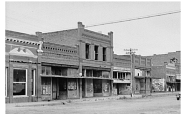
THE GREAT DEPRESSION devastated every part of America, even its smallest towns.

Old myths never die; they just keep showing up in economics and political science textbooks. With only an occasional exception, it is there you will find what may be the 20th century’s greatest myth: Capitalism and the free-market economy were responsible for the Great Depression, and only government intervention brought about America’s economic recovery.