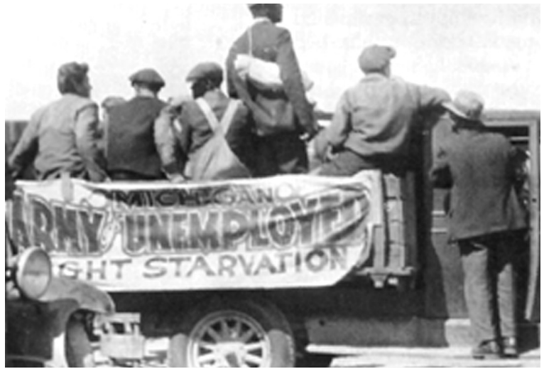
UNEMPLOYMENT SKYROCKETED AFTER Congress raised tariffs and taxes in the early 1930s and stayed high as policies of the Roosevelt administration discouraged investment and recovery during the rest of the decade.

Reckless money and credit growth constituted what economist Benjamin M. Anderson called "the beginning of the New Deal" 4 — the name for the better-known but highly interventionist policies that would come later under President Franklin Roosevelt. However, other scholars raise doubts that Fed action was as inflationary as Rothbard believed, pointing to relatively flat commodity and consumer prices in the 1920s as evidence that monetary policy was not so wildly irresponsible.