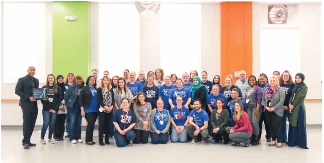
The staff at Hamtramck Academy.

A high level of spending doesn't explain the district's success. Dearborn spends a little more