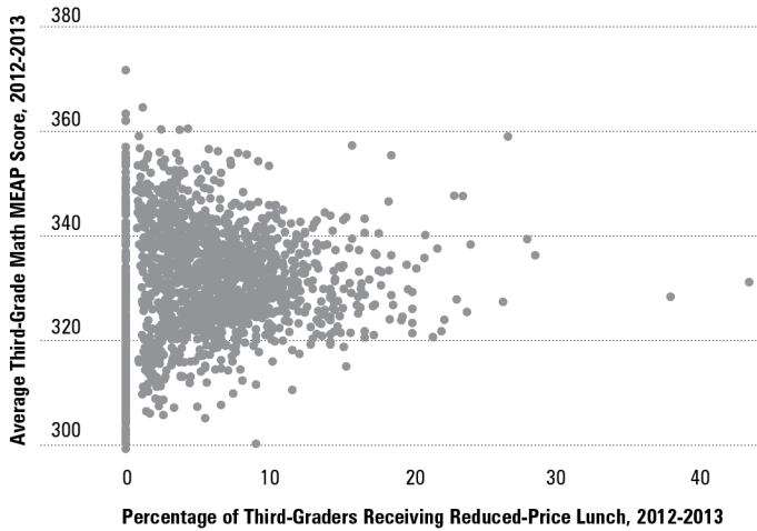
Graphic 18: 2012-2013 MEAP Mean Scale Scores in Mathematics vs. Percentage of Students Eligible for Reduced-Price Lunch, by School, for Third-Graders

Source: Author's representation of data in "MEAP Downloadable Data Files," (Michigan Department of Education, 2013), http://goo.gl/uexp2 (accessed March 21, 2013); "Free and Reduced Lunch Counts," (Center for Educational Performance and Information, 2013), http://goo.gl/kopSa (accessed March 21, 2013).