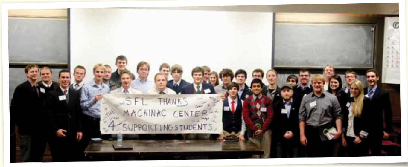
Members of Students for Liberty, a national organization dedicated to advancing free-market ideas on campus, convey their gratitude for the Mackinac Center's support of their Oct. 1 Midwest Conference in Chicago.