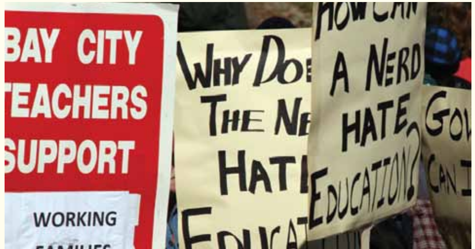
Legislative efforts to control public education costs generated the usual protests and hyperbole.

For example, a Michigan Education Association official claimed that some first-year teachers in the Lansing School District were being paid wages that were below the poverty line. CapCon was able to inform its readers that the federal