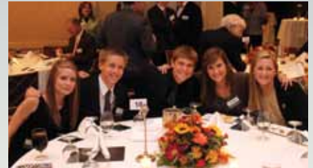
Advanced Placement government students from Milford High School enjoy the event.