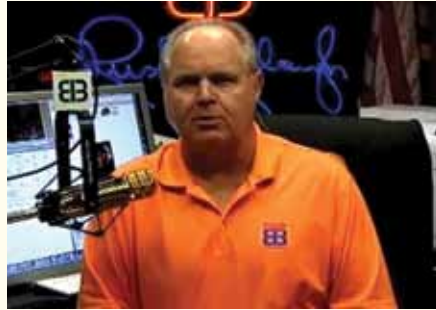
Talk show powerhouse Rush Limbaugh discusses the Mackinac Center lawsuit on his “Morning Update.”

The story received coverage in newspapers and on broadcast outlets throughout the state, including the Lansing State Journal, The Flint Journal, the Petoskey News-Review, WILX News 10 in Lansing, WEYI NBC25 in Flint, WNEM TV5 in Saginaw, WJR 760 AM in Detroit, WHMI 93.5 FM in Howell, WCMU in Mt. Pleasant, WTCM Talk Radio in